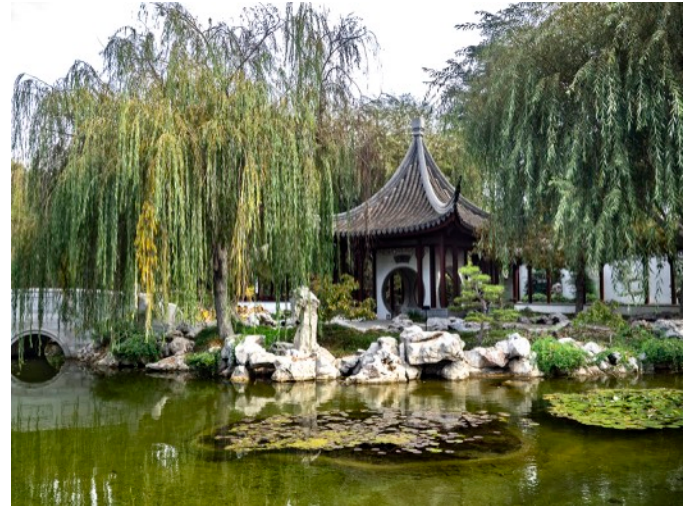
SAA members enjoyed the beautiful Garden of Flowing Fragrance 流芳園 at the Huntington Library during the Gardens and Museums of Pasadena trip, November 12 -17, 2019.