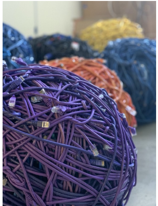
Left: Sculptures constructed from obsolete cell phones in forms reminiscent of irregular, rough-hewn scholar's rocks in Chinese art. Right: Donated data devices are entombed by cords to create orb-like seating.