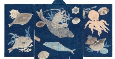
Cotton tsutsugaki (freehand resist). Japan, 20th century.

When: Saturday, March 7 Time: 10:30 a.m. - 12:00 p.m. Place: Koret Education Center, Asian Art Museum Fee: $15 Society members; $20 non-members (after museum admission)