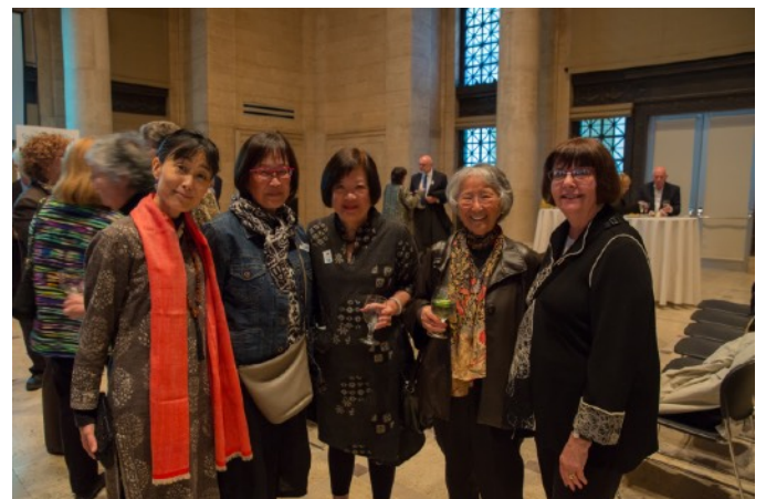
SAA board members mingling with SAA members during the SAA 60th anniversary celebration at the 2018 Annual Meeting.