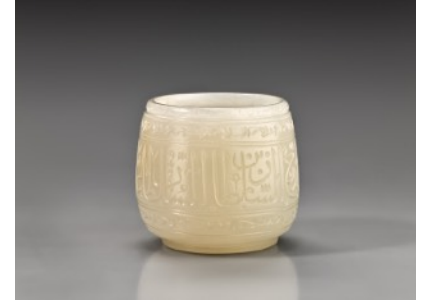
Cup with calligraphic inscriptions, 1440–1460. Probably Uzbekistan; Samarqand, Timurid period (1370–1507). Nephrite. Asian Art Museum, The Avery Brundage Collection, B60J619.