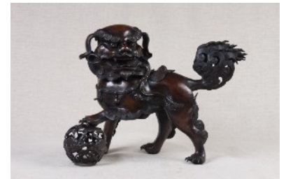
Bronze shishi koro. Japan; Meiji period. (1868 - 1912).

Transportation and accommodations are on your own. There are several hotels within walking distance of Orientations. It is highly recommended to book hotels at your earliest convenience! Celebrate spring with a weekend in Monterey with good food, lively conversation, and magnificent objects in an incomparable setting.