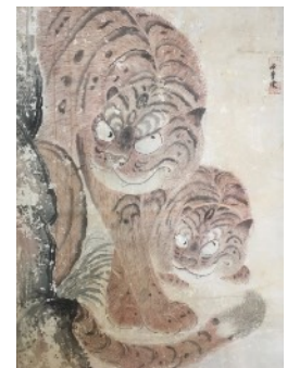
Tigers. Japan; early Meiji period (1868 - 1912).