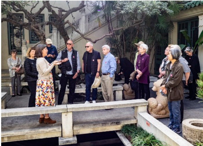
SAA members enjoying a tour during the Gardens and Museums of Pasadena trip, November 12 -17, 2019.