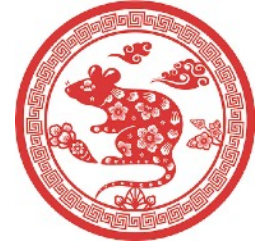
Year of the Rat

We will feast on a tasty multi-course dinner on the second floor of one of our favorite Chinese restaurants, Ton Kiang. Sign up now to ensure your place at this most enjoyable social event. Wine will be served.